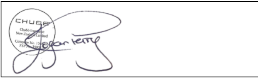
Authorised Signature and Stamp

This Policy and Schedule have been signed on behalf of Chubb Insurance New Zealand Limited (Chubb).